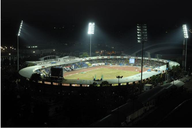
Fig. 1. Four stadium lighting towers (Bajaj Electricals, 2013).

so many tables, formulas and figures in the wind load calculation procedure for the use of people using this standard in their calculations. Moreover, mean wind speed is not taken from a table or a chart. It is calculated from the basic wind velocity and the fundamental value of the basic wind velocity.