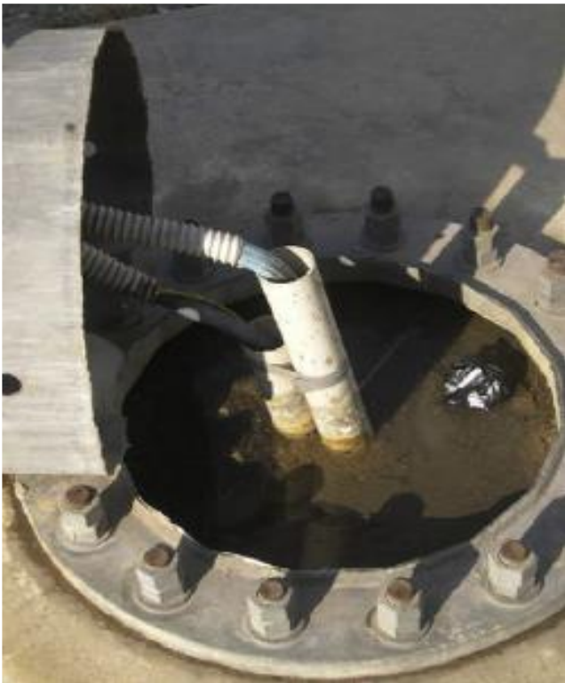
Fig. 2. Base of collapsed steel lighting tower (Repetto and Solari, 2010).

In this part of the study, it is aimed to give only brief information about the procedure used in the calculation of along-wind loads according to Eurocode 1. The across-wind forces are not in the scope of this paper. Eurocode 1 is open to the use of the public. Therefore, there is no need to give detailed calculation procedures of the standard for the purpose of the volume limitation of the study.