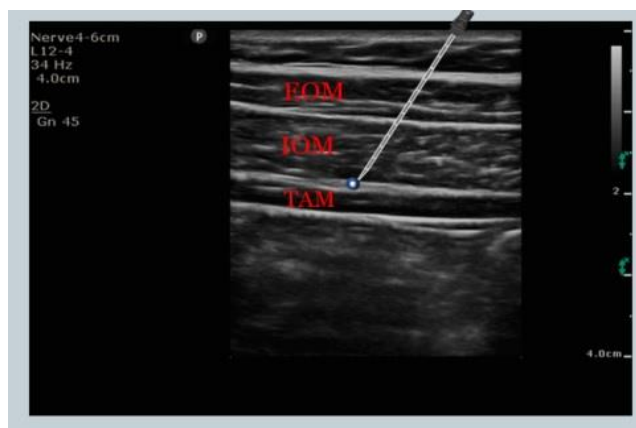
Fig. 2. Sonoanatomy of TAP block. EOM: External oblique muscle, IOM: internal oblique muscle, TAM: Transversus abdominis muscle.

We prepared 0.5% bupivacaine at a dose of 1.5 mg/kg for block procedure. We diluted 0.5% bupivacaine at lower concentrations with normal saline. We used a mixture of bupivacaine and saline. After confirmation, 40 ml of local anesthetic solution was given bilaterally to the interfascial plane between transversus abdominis and internal oblique muscles.