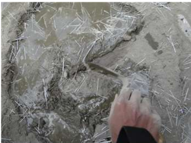
Figure 3. Mixing of Fibrous Cement Mortar