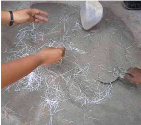
Figure 1. Mixing of Polyolefin Fibers with dry cement mortar