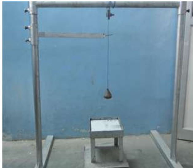
Figure 5. Impact test set-up

In this study, w=29.43 N (weight of the steel ball) and h=0.6 m (height of fall), but the number of blows are kept constant and the actual number of blows (average of 3 specimens) during first crack and ultimate failure of specimens have been used in the above formula, and presented in Table 5 and Fig.6 and Table 6 and Fig.7 respectively.