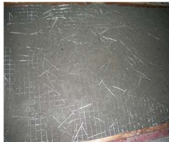
Figure 4. Laying of fibrous mortar over steel mesh in cementitious composites