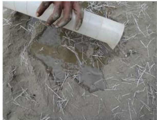
Figure 2. Adding water to dry fibrous mortar